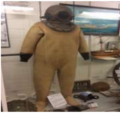
Deep sea diver suit