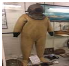
Deep sea diver suit

From a fun and exciting water floor trail of exhibits, discover the special connection between the Aboriginal people of Quandamooka to the lakes and seas and the importance of water in the settlement of the Redland's by Europeans. Participants will be given a questionnaire relating to the exhibits and to assist them to spell the special word.